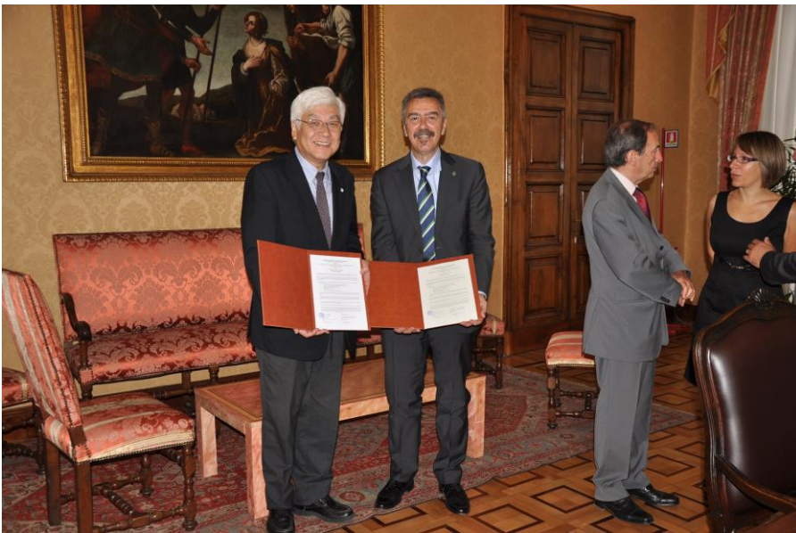
Firma Protocollo (Rettorato, Torino 01 09 2015)