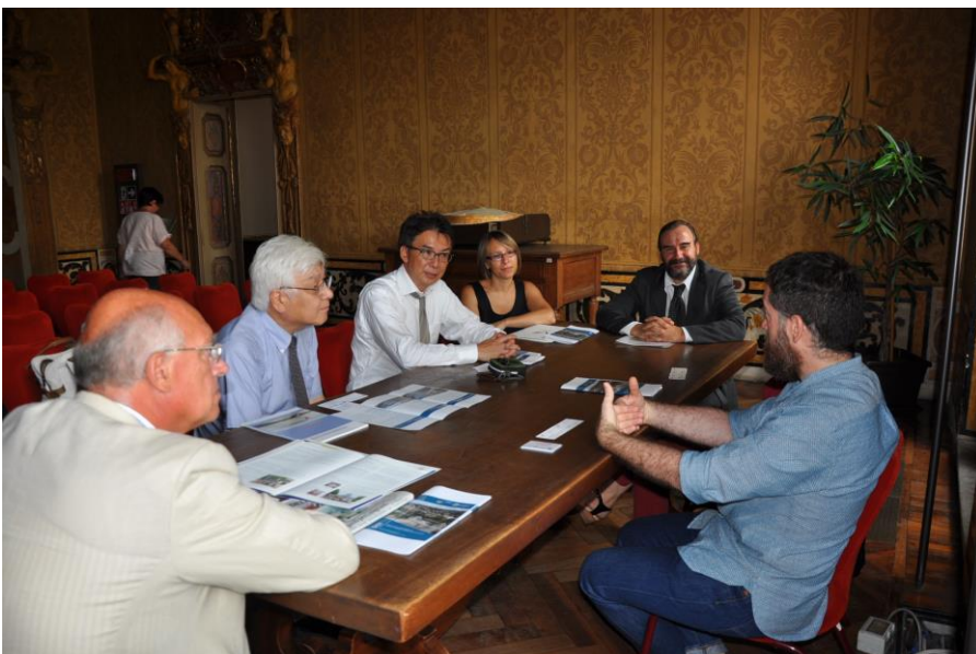
Incontro al Castello del Valentino (Torino 01 09 20 15)